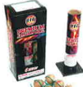
Reloadable Shell Device