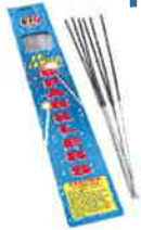
Sparklers & Sparkler Trees