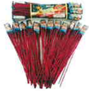
Bottle Rockets/ Sky Rockets