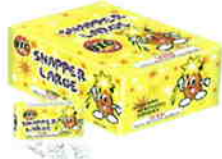
Snappers/ Drop Pops