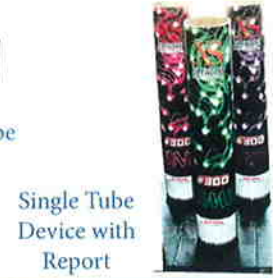
Single Tube Device with Report